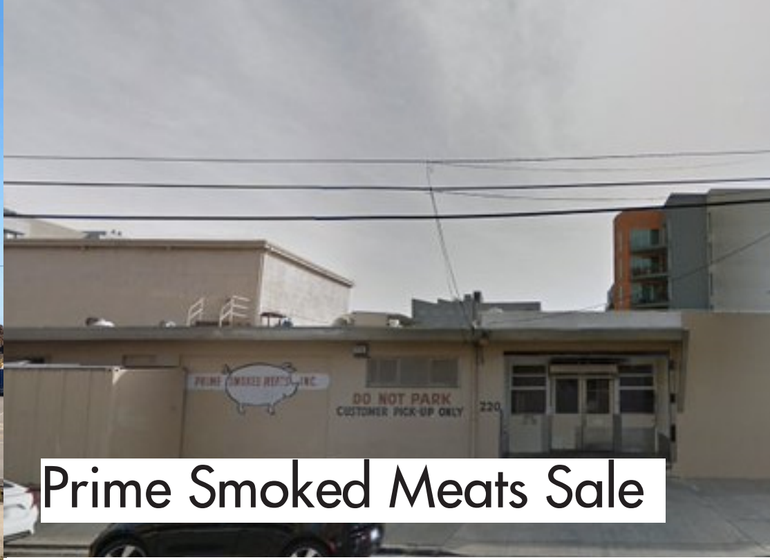
Prime Smoked Meats Sale