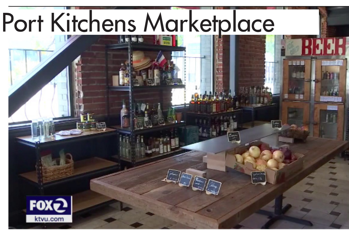
Port Kitchens Marketplace

Ghost kitchen business model offers food entrepreneurs flexibility