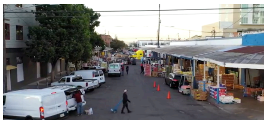
Wholesale Produce Market unique in Jack London

We're taking an opportunity to look back on a full year of programs, projects completed, and partnerships formed.