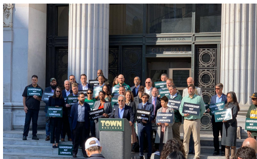
Business leadership gathers to support the Howard Terminal A's Stadium Development