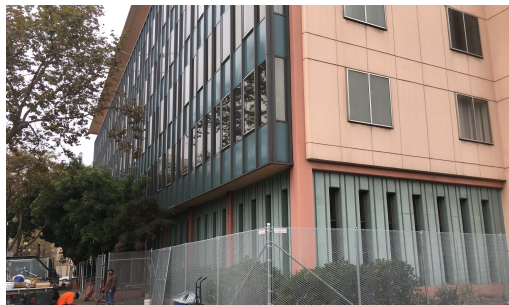
Advocacy for a plan to activate and redevelop publicly -owned blocks continues