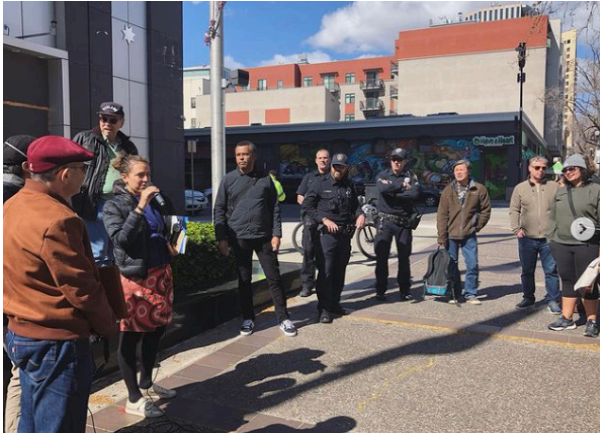
Hosted Downtown/Chinatown/Jack London BID Leadership Walking Meeting with Electeds, OPD