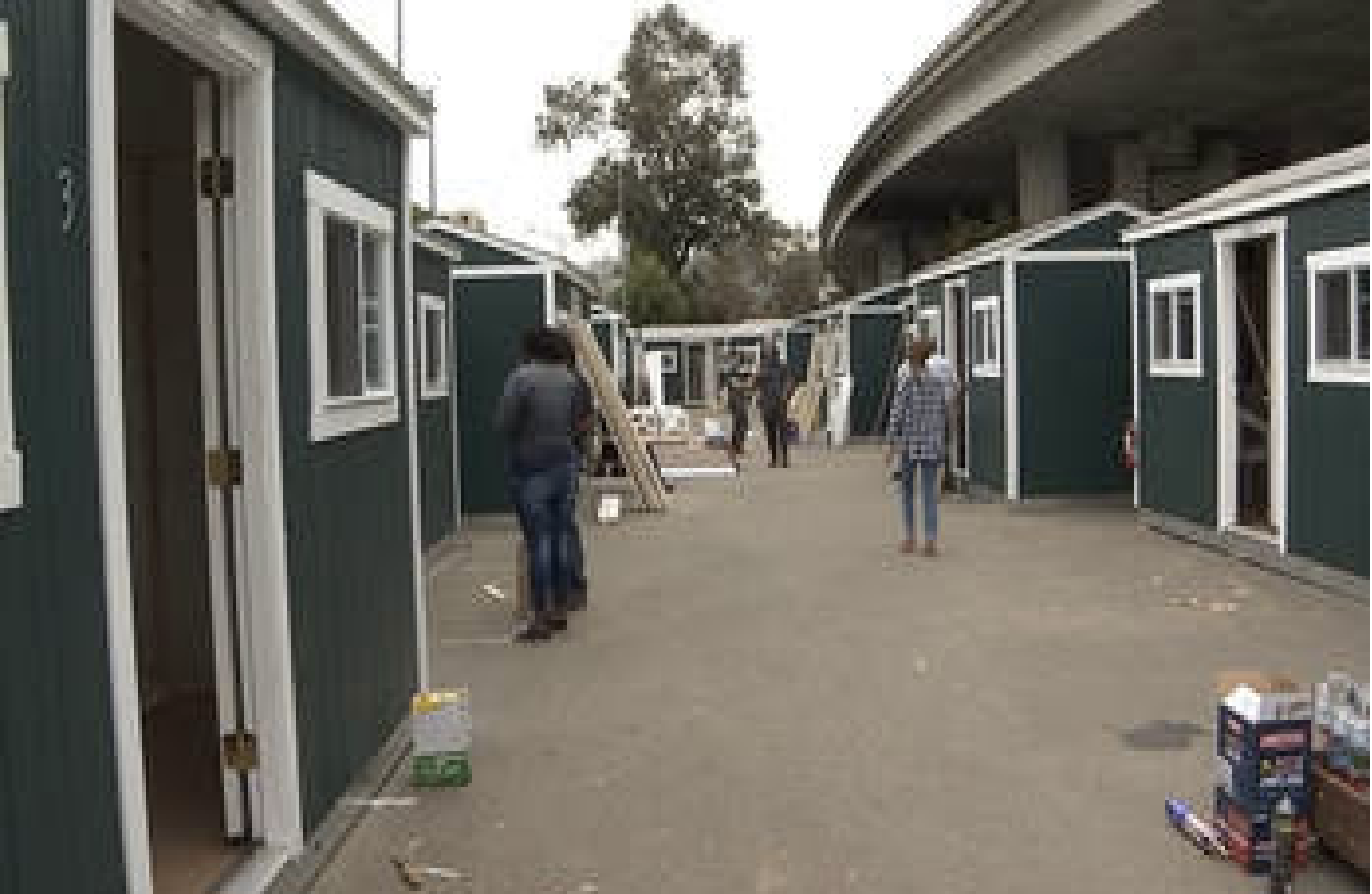
Cabin Community at 5th and Oak